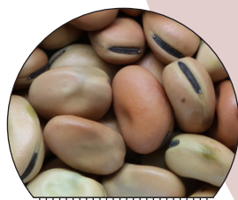
PBA Zahra ®