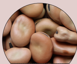
PBA Amberley ®

Source: NVT. Data derived from 25 rainfed trials in SA, Vic and th NSW in 2016–2018