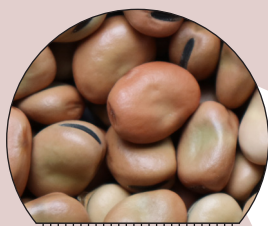
PBA Samira ®