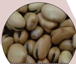
PBA Samira ®