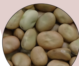
PBA Marne ®

The seed of PBA Marne ® should be suitable to co-mingle with similar varieties for export to the major food markets in the Middle East.