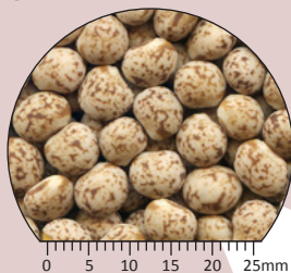
PBA Gunyidi ®