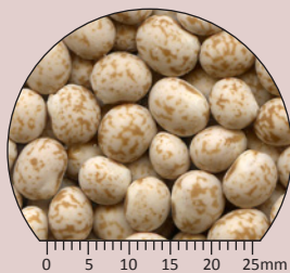
PBA Jurien ®

Protein and alkaloid: % as received, whole seed, 6 sites, 2010–2014