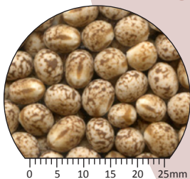
PBA Barlock ®