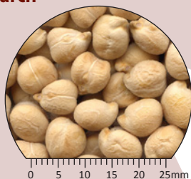
Genesis ™ 090