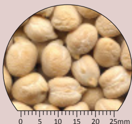
PBA Monarch ®

Data is average of 9 sites, southern (7 sites) and northern (2 sites) Australia across 4 years (2009-12)