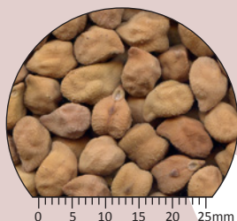
PBA Slasher ®