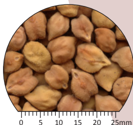
PBA Maiden ®

Data is average of 11 sites in southern Australia across 4 years (2009-12)