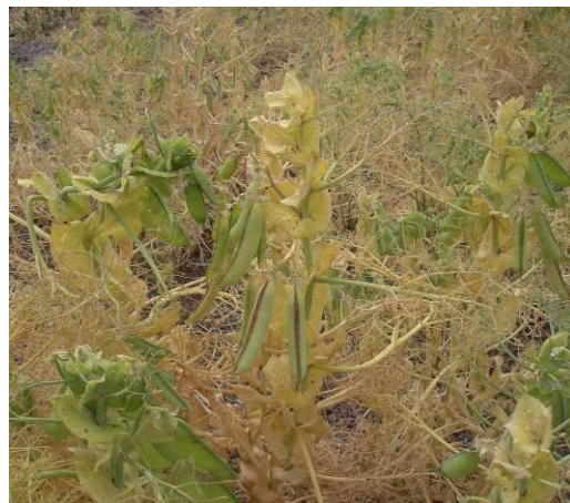
Photograph courtesy- DAFWA

Croptopping and desiccation in field pea -NSW DPI