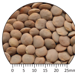
PBA Jumbo ®

PBA Jumbo ® is a large sized red lentil. It has a lens-shaped seed similar to Aldinga but with a grey seed coat. Seed size, as measured by 100 seed weight, is generally 20% greater than Nugget and similar to Aldinga. PBA Jumbo ® demonstrated improved seed milling characteristics compared to Nugget, and similar to Aldinga in laboratory testing.