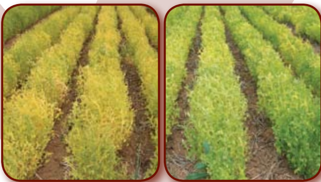
PBA Flash ® (left) showing its earlier maturity compared to Nugget (right).