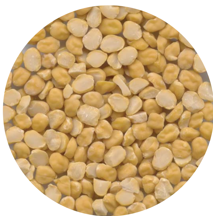
chana dhal from chickpeas

Pulse grain is the edible seed from the pod of a legume crop that is grown for human consumption. Pulses include chickpeas, lentils, peas, faba beans, mung beans and other legume crops. Pulses contain a wide range of nutrients, including carbohydrate (sugars and starches), dietary fibre, protein, unsaturated fat, vitamins and minerals, as well as non-nutrients, such as antioxidants and phytoestrogens.