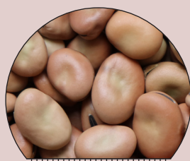
PBA Amberley ®

Source: NVT. Data derived from 25 rainfed trials in SA, Vic and th NSW in 2016–2018