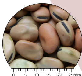
PBA Zahra ®