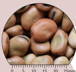
PBA Samira ®