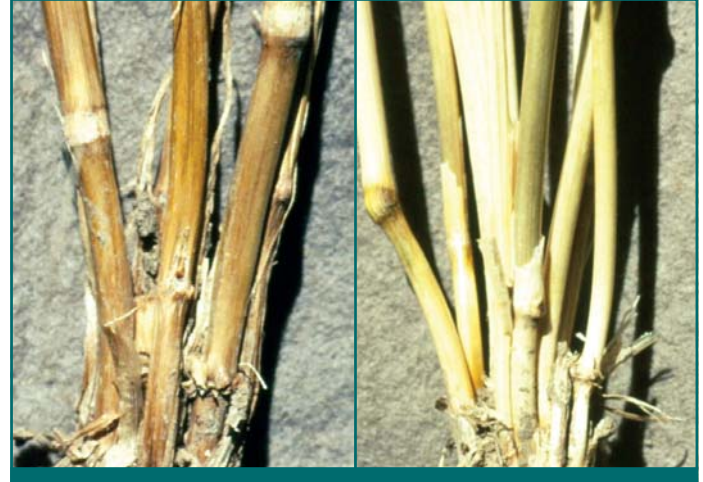
Basal browning characteristic of crown rot left, compared to healthy plant right.

Yield losses from crown rot are therefore most severe in seasons with a wet start followed by a dry finish.