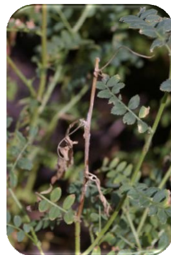
Figure 5: Ascospore infection of chickpea stem by S. Sclerotiorum .

These release air borne ascospores that infect above ground parts of the chickpea plant, often starting in leaf axils (Figure 5). Stem tissues above and below the infection point initially remain green.