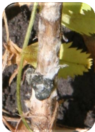
Figure 2: Sclerotes of S. sclerotiorum .

S. sclerotiorum produces large irregular shaped sclerotes 5-10 mm in diameter as high up as 20-30 cm on the stem (Figure 2).