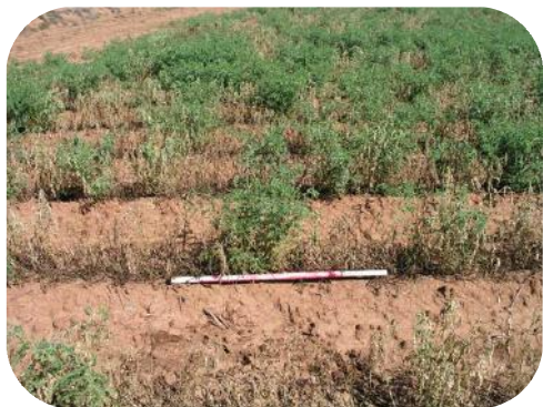
Figure 1: S. sclerotiorum killed these plants – eventually the whole crop was lost.

In 2010, sclerotinia was more common than in previous years and in some paddocks caused serious damage (Figure 1) - 100% loss in one kabuli crop near Dubbo.