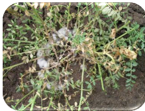
Figure 4: Fungal weft of sclerotinia in the lower canopy of a chickpea crop.

In dense crops, during moist conditions, a white cottony fungal weft develops around the base of plants (Figure 4).